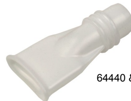
64440 & 64441