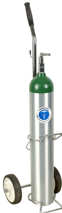
65070 shown with E cylinder (cylinder not included)