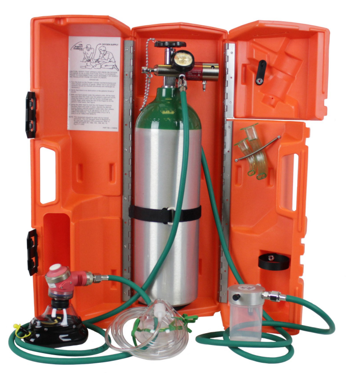
L175-140R (cylinder not included)

The LSP Portable Resuscitator is a fast, simple, and effective system to resuscitate a nonbreathing patient while performing CPR, or to provide 100% oxygen to a breathing patient on demand with minimal inspiratory effort. There are no adjustments to make or dials to set. Simply connect the desired resuscitation device and open the cylinder valve, and the resuscitator is ready for use.